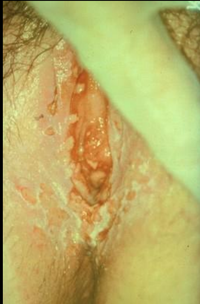
Primary herpes, female