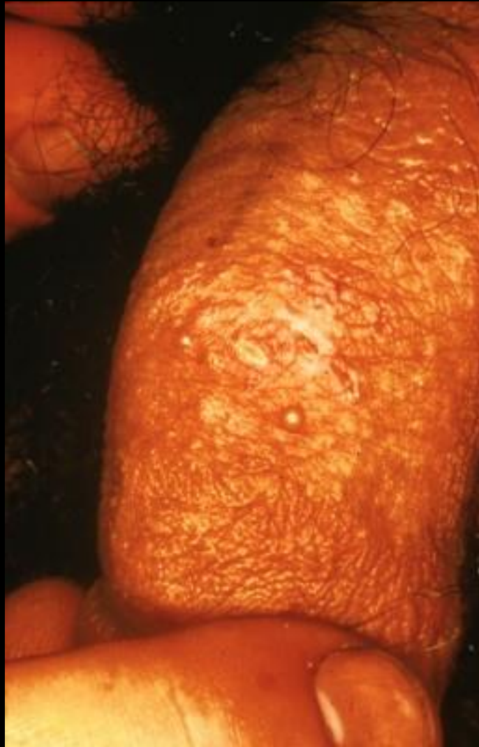
Recurrent herpes, male