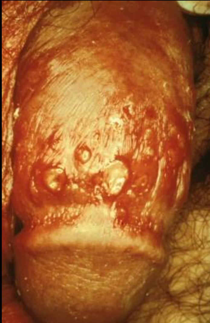
Primary herpes, male